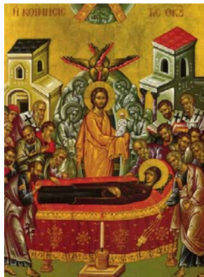
Icon of the Dormition of the Holy Theotokos

The Holy Apostle Paul writes of the universality—the oneness—of the Gospel of Christ. There is only one Gospel, which preaches that Christ died for us, was buried, and rose again according to the Scriptures. In this passage, St. Paul writes of the apostolic tradition which he delivers to the Corinthians, that he receives from direct experience with the Risen Lord and the interactions with the original apostles. The apostles are all unified by the Grace of God. Therefore, so long as one receives the Gospel of Christ through this Grace, and hold fast to it, one can be united in the salvation of Christ.